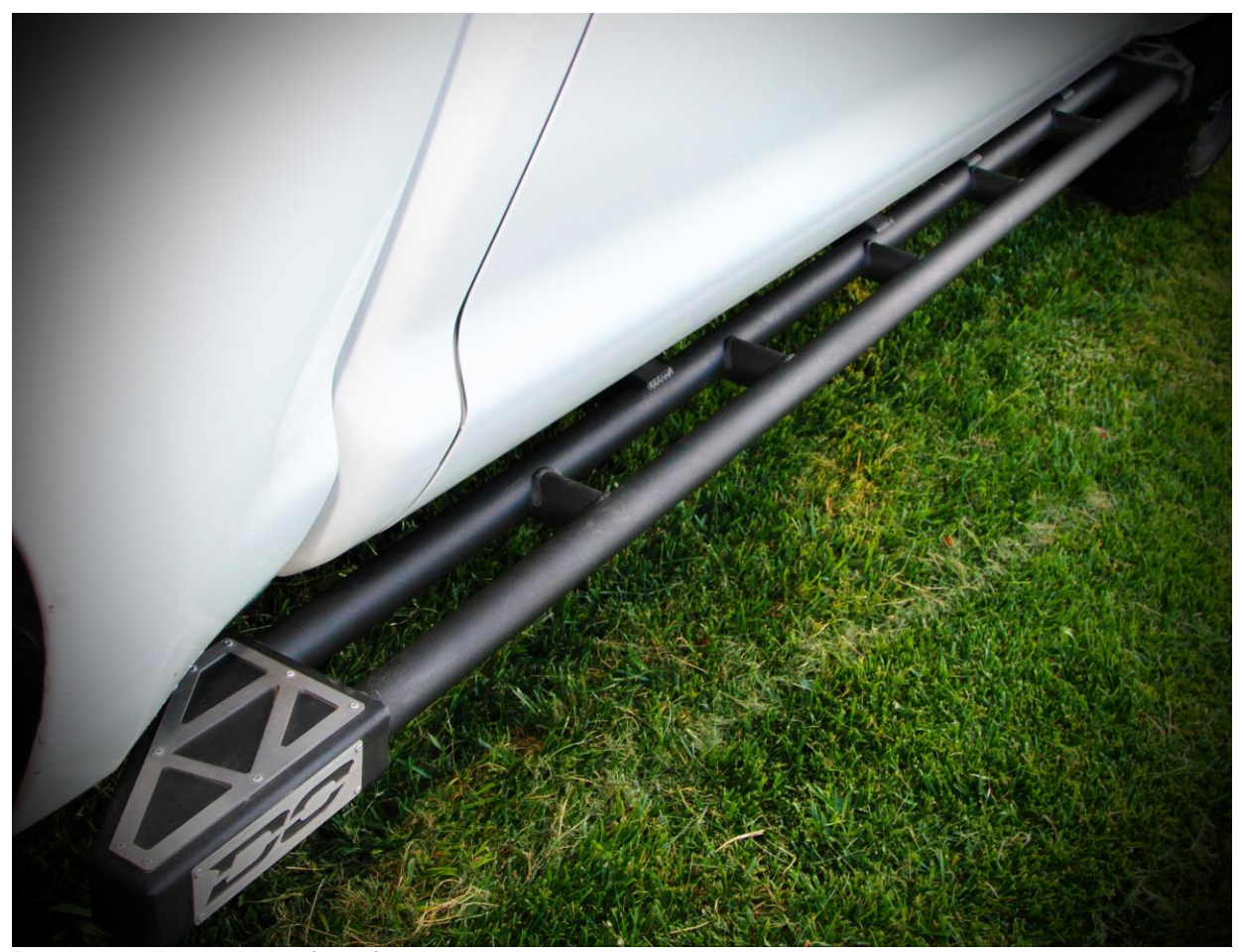
Dominator sliders shown for reference.